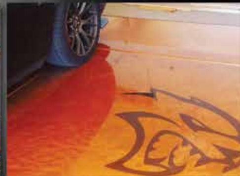
Metallic Urethane Coating with Hell Cat Logo