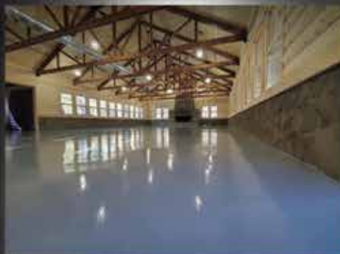
Industrial Shop Concrete Coating