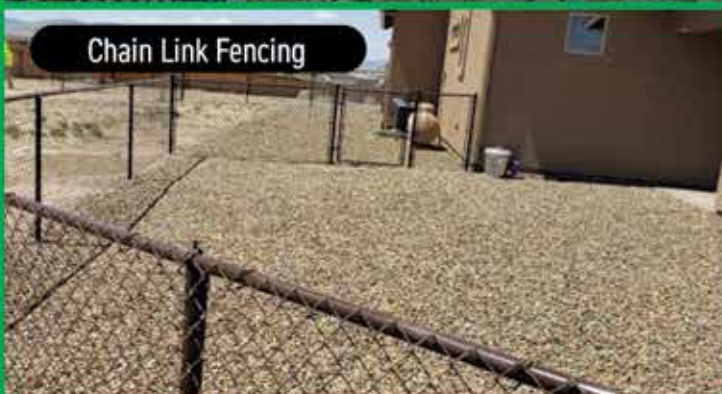
Chain Link Fencing