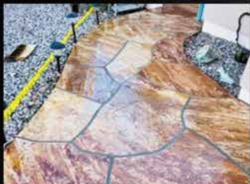
Turn Old Flagstone or Brick into a Show Case

Garages • Waterproof Decking • Patios • Driveways • Indoor/Outdoor • Industrial Shops