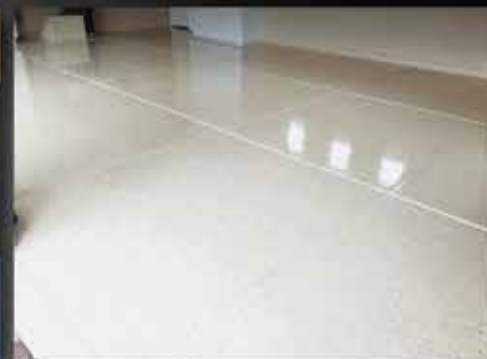
Garage Floor Coating is our Speciality