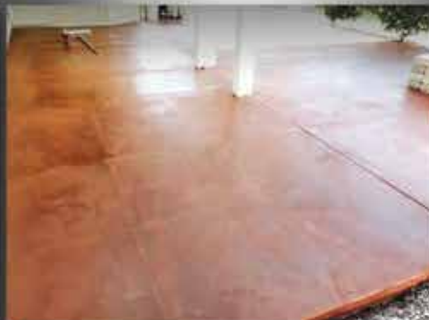
Complete Patio Concrete Resurface Coating