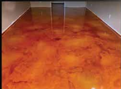
Indoor Stained Concrete Coating