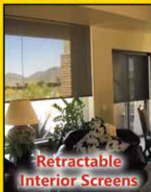
Retractable Interior Screens